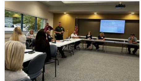
Community leaders from the local police, fire, office of emergency management and other first responders joined the hospital staff for an emergency preparedness drill.