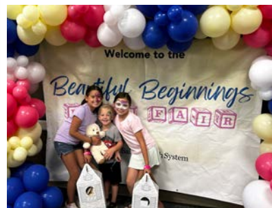
The hospital hosted its second Beautiful Beginnings Baby Fair, bringing together community resources and vendors to support expecting families in the community.