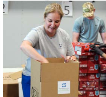
As a sponsor for the Arkansas Foodbank's summer feeding program, Saline employees joined the foodbank in preparing boxes of food for students in need.