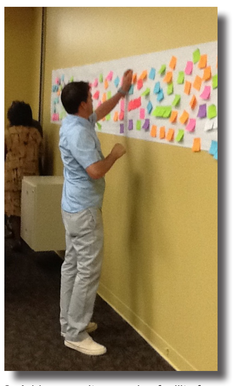
Action 2: Add an on-site exercise facility for staff and physicians at Hospital and at large employers

Action 1: Community bicycle trails, closest shopping parking is bicycle rack