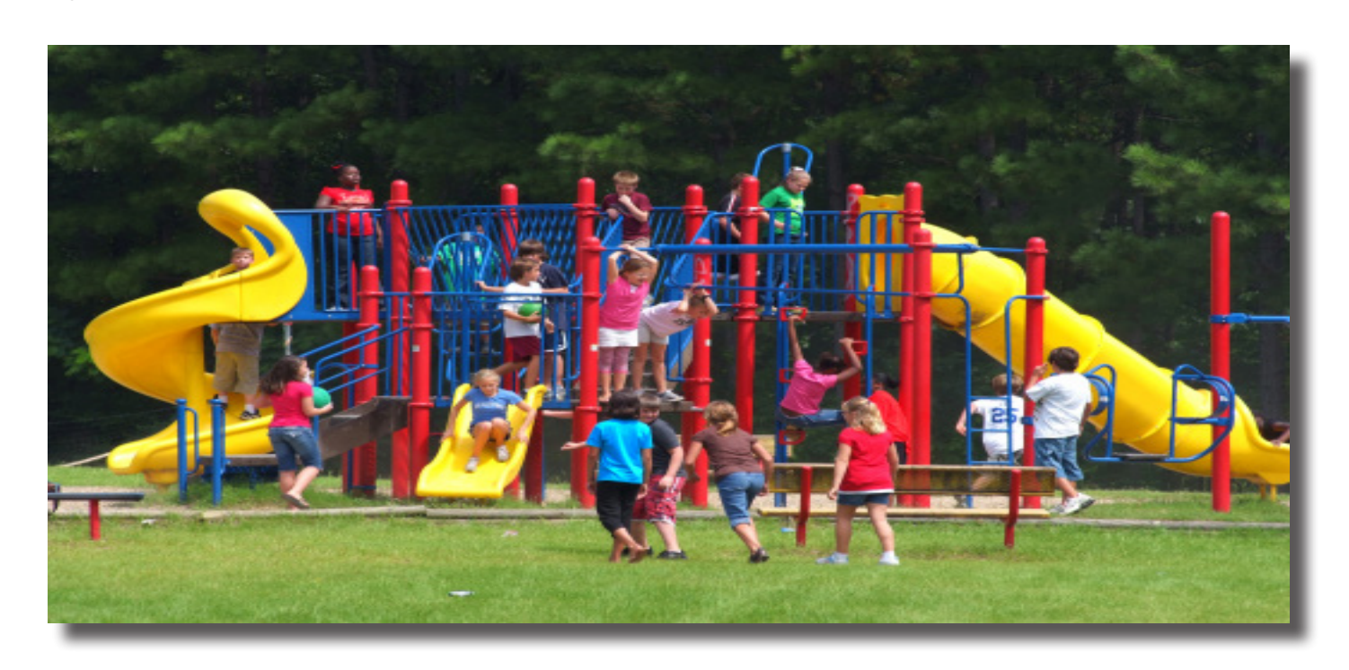
Funding for this project was provided by Saline Memorial Hospital